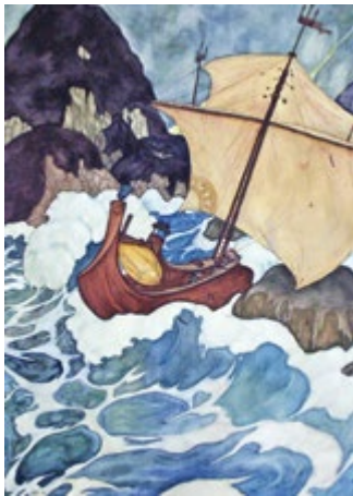
Alice Shea, Age 15 Homeschool Student Watercolor