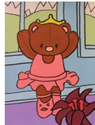
Elsa Bildsten, Age 6 Acrylic