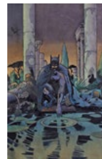
State Fair Winner! Izzy Wexler-Mann, Age 14 Watercolor

All levels of study. Students learn the painting techniques of fantasy art masters. After these skills are understood, they are asked to develop original ideas by combining figure construction, costume design, composition studies, and photographic reference into finished pictures using traditional, layering techniques in watercolor and oil.