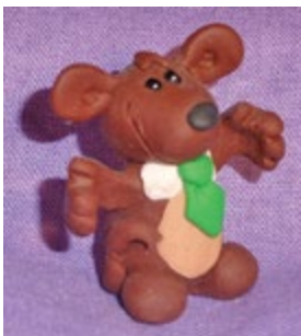
Micah Morse, Sculpture Instructor Happy Mouse