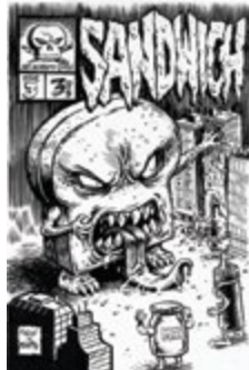
Bill Hauser and David Witt, Instructors Cover Illustration to Sandwich #3