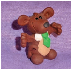
Micah Morse, Sculpture Instructor Happy Mouse