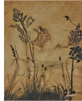
Sophia Balabanova, Age 14 Watercolor

Sculpture Level 1: Wednesdays 6:00-8:00 p.m. (Make-up Class—Thursdays from 6:00-8:00 p.m.) Sculpture Level 2: Thursdays 6:00-8:00 p.m. (Make-up Class—Wednesdays from 6:00-8:00 p.m.)