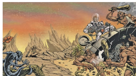
Bill Hauser, Instructor Album Cover

Explore character development, page layout, perspective, camera angles, lettering and advanced inking techniques.