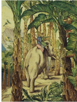
State Fair Winner! Isabella McCormick, Age 13 Watercolor