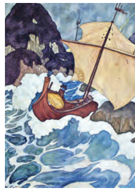
Alice Shea, Age 15 Homeschool Student Watercolor