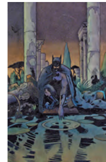
State Fair Winner! Izzy Wexler-Mann, Age 14 Watercolor

All levels of study. Students learn the painting techniques of fantasy art masters. After these skills are understood, they are asked to develop original ideas by combining figure construction, costume design, composition studies, and photographic reference into finished pictures using traditional, layering techniques in watercolor and oil.