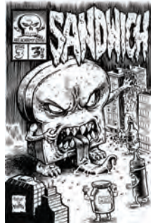
Bill Hauser and David Witt, Instructors Cover Illustration to Sandwich #3