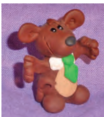
Micah Morse, Sculpture Instructor Happy Mouse

Level 2 Thursdays 6:00-8:00 p.m. (Make-up class—Wednesdays from 6:00-8:00 p.m.)