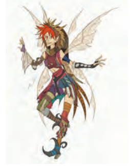
Eliza Baker, Instructor Character Design

All levels of study. Students learn about figure construction, anatomy, costume design, gesture, facial expression, inking and color techniques. After these skills are understood, they are encouraged to create their own Manga, Super Hero, and Fantasy Figure characters.